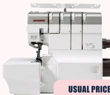
Air Thread 2000D Professional

Easy-to-see clear-view foot comes as a standard accessory!